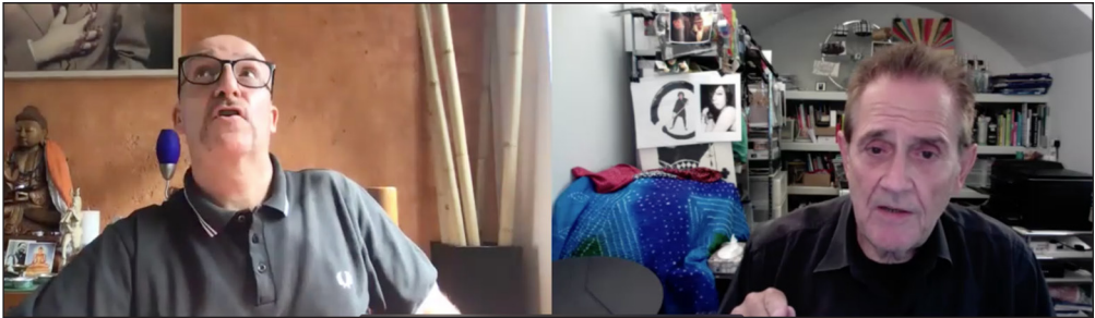
Figure 6: Earthquake via Zoom. (10:34 am CST June 23. Temblor was 7.5).