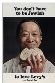
Figure 1: Not perfect looking white people. Magazine campaign for Levy's. (DDB 1961–1970).

It worked brilliantly. And it is important to remember that brands shouldn't want to be doing whatever everybody else is doing, because if they do, then only the market leader can win. So, if you are a small beer and do the same advertising as Budweiser, then you lose as everyone will think it is the same ad, it's better to differentiate yourself. Stupid marketers copy what the market leader is doing and that confuses your brand with the market leader and your brand disappears.