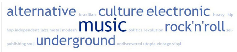
Figure 1: Tag crowd of the terms used in the sampled programming description (2016).